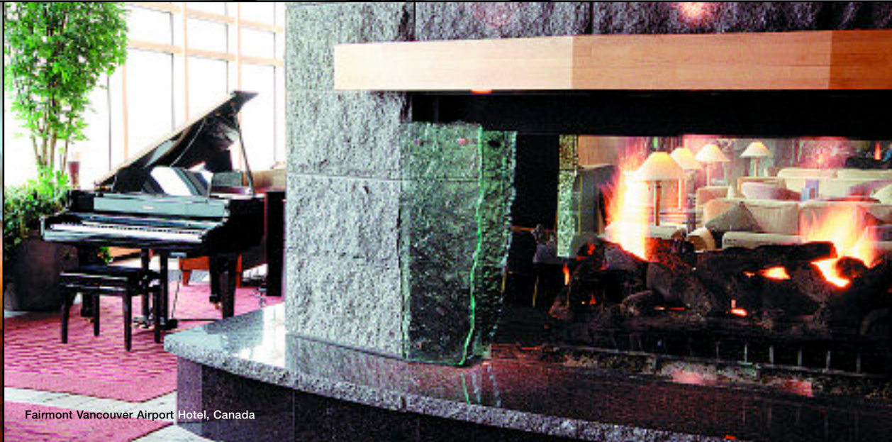
Fairmont Vancouver Airport Hotel, Canada