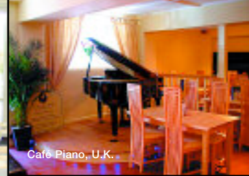
Café Piano, U.K.