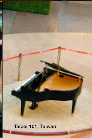
Taipei 101, Taiwan