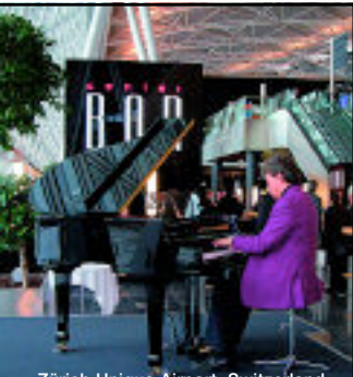
Zürich Unique Airport, Switzerland

What could be more inviting? That's what makes the Intelligent Grand Series from Roland the perfect complement for your model home, hotel lobby, cruise ship, or luxurious living room. Up-to-the-minute creations of musical artistry and technology blended together in elegant comfort – these are the finest digital pianos ever conceived from a world leader in instrument design. Your eyes and ears won't be able to tell the difference between digital and acoustic.