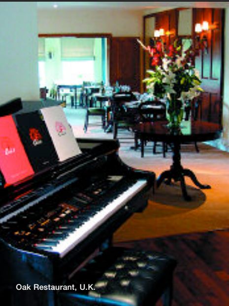
Oak Restaurant, U.K.