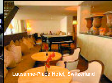
Lausanne-Place Hotel, Switzerland