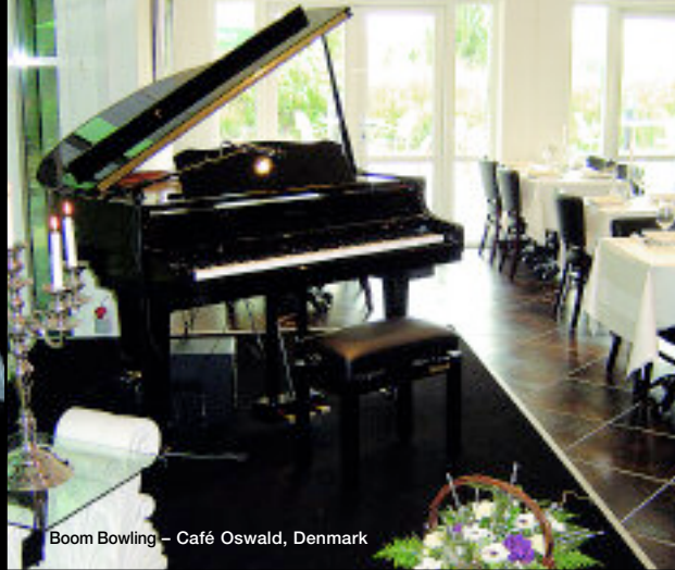
Boom Bowling – Café Oswald, Denmark