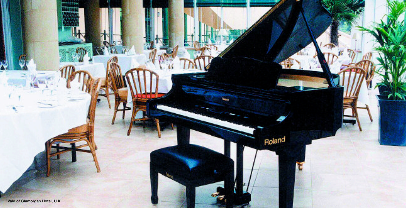
Vale of Glamorgan Hotel, U.K.