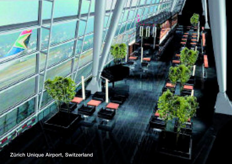
Zürich Unique Airport, Switzerland