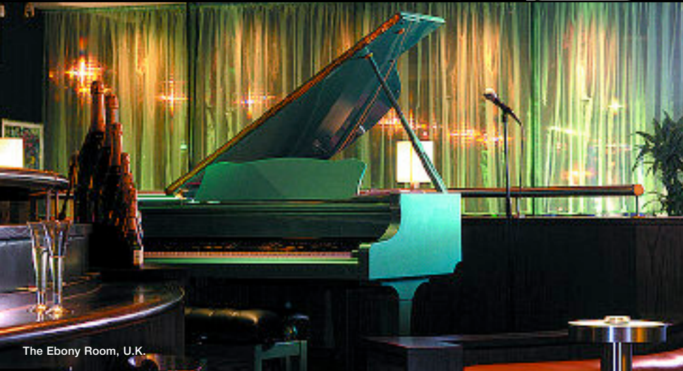
The Ebony Room, U.K.